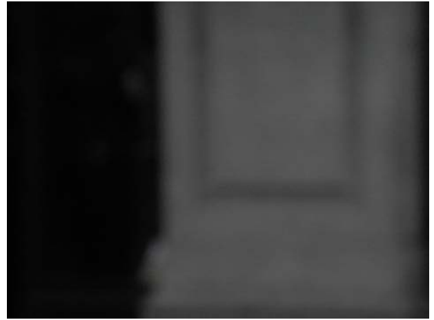
Urban Abstraction, London 5, 2010