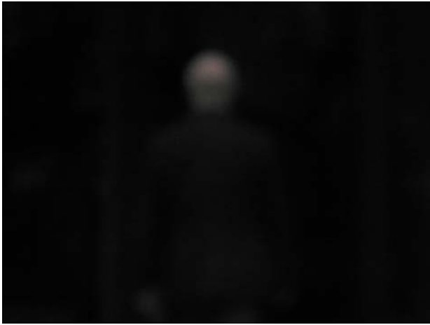
Urban Abstraction, London 4, 2010